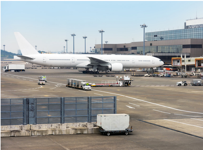
Retrofit Fibrelite covers specified for major northern UK airport