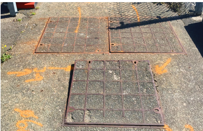
Previously installed heavy concrete recess covers