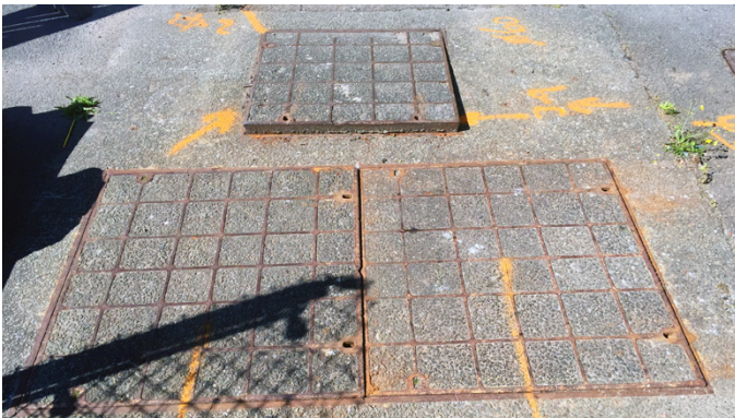
Covers were showing signs of severe corrosion

Fibrelite were pleased to play a part in this major project which will see the highest quality of suppliers from every industry leave their mark on this bustling facility.