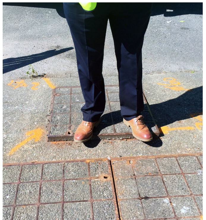
Previously installed heavy concrete recess covers were showing signs of severe corrosion