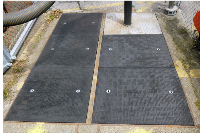
Fibrelite covers allow safe removal by hand

This northern airport now has an access solution that will continue to perform for the years to come.