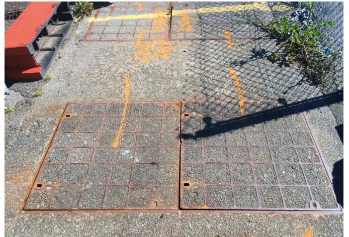
Covers were very heavy, making them time consuming to remove