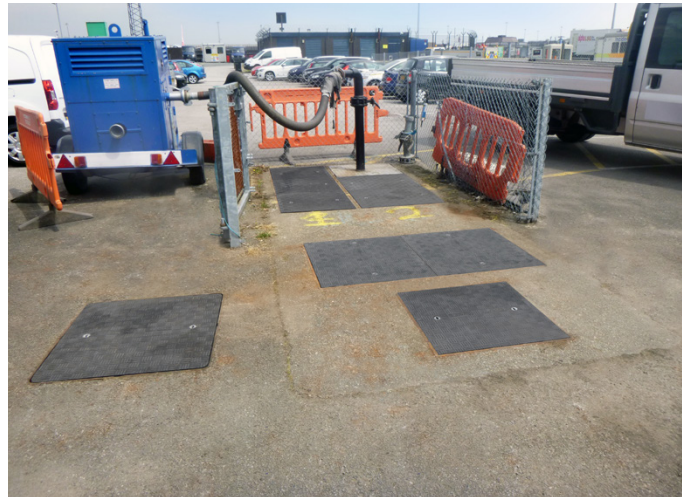
Previous health and safety risks nullified by Fibrelite covers

For more information on Fibrelite's product range please contact us: