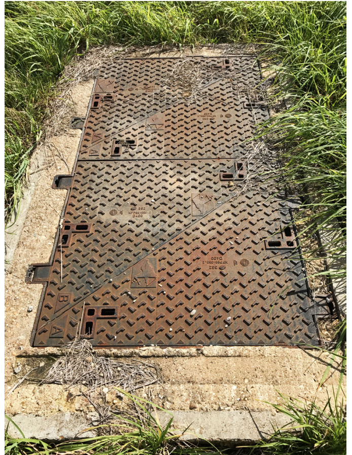
Ease of access to the runway lighting pits off apron was of paramount importance