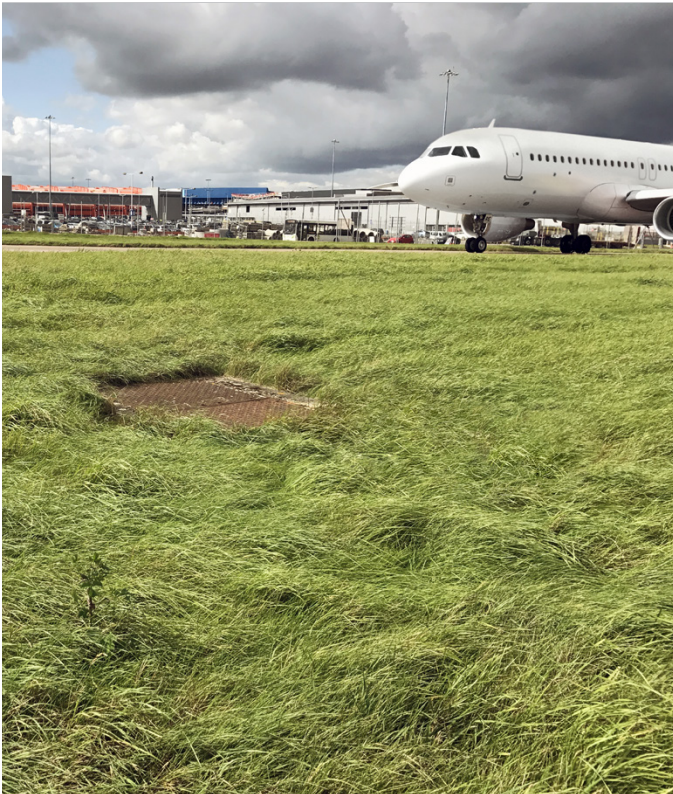
Fibrelite covers provide lightweight retrofit replacement for heavy cast iron trench covers at regional UK airport