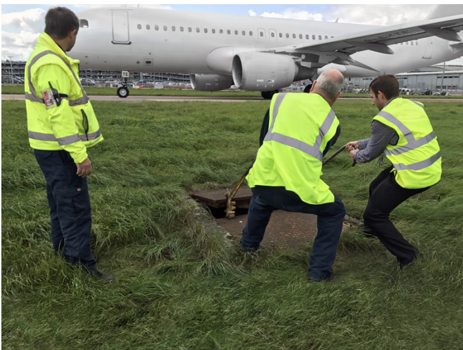
The previously installed cast iron trench access covers were extremely heavy, making them difficult to manoeuvre

This regional UK airport was looking for an upgrade for their access covers over the off-apron runway lighting pits. Fibrelite were singled out as an ideal supplier for this retrofit project due to the bespoke GRP access covers they can offer as well as their industry leading strength to weight ratio.