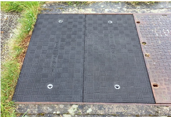
Fibrelite's lightweight F900 load rated trench covers