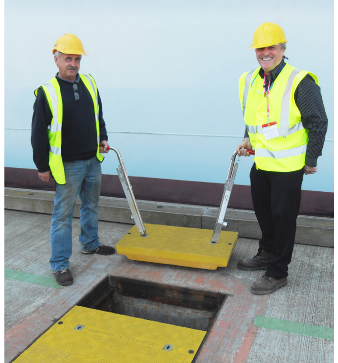
Fibrelite's lightweight F900 trench covers can be safely and quickly removed by 2 people (image used for illustration purposes and shows a different installation)

For more information on Fibrelite's product range please contact us: