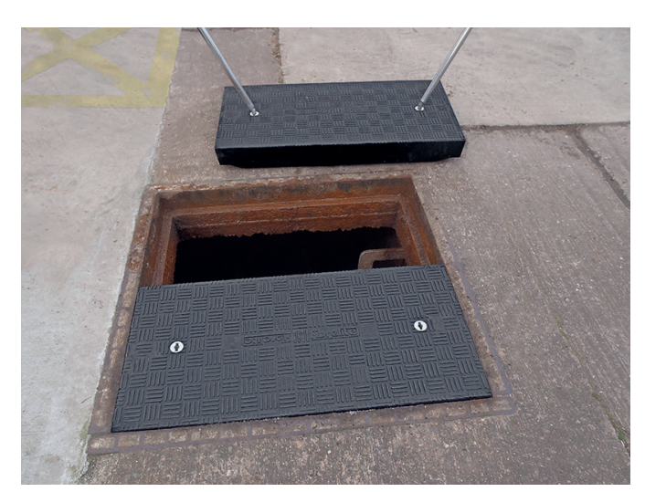
Bespoke Fibrelite covers installed into existing frame

Traditional concrete covers are extremely difficult to remove to allow access, often requiring time consuming, expensive, specialist lifting equipment. This often leads to manual handling problems and possible risks to operatives trying to remove the covers. Fibrelite's new range of bespoke replacement composite covers offer the best strength to weight ratio in the industry. Whilst achieving BS EN124, D400, E600 and F900 load ratings their unique composite design means they can be easily removed using a simple ergonomically safe lifting handle.