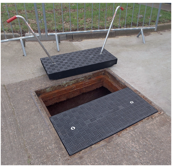
Easy and safe manual handling with Fibrelite lifting handle