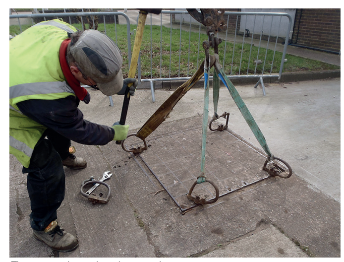
Time consuming and costly removal process