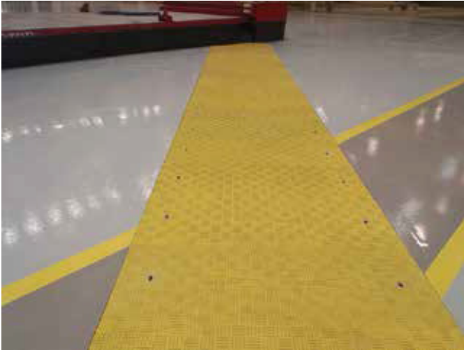
The Fibrelite yellow C250 (25 tonne) load rated standard duty trench access covers