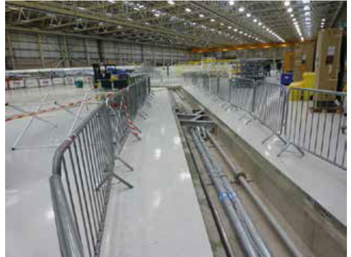
Essential service pipework required for the production process