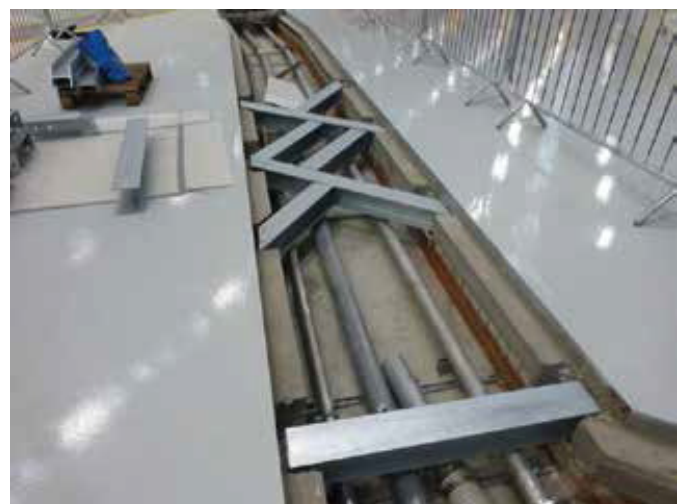
Fibrelite covers needed to be manufactured to work with pre-installed steel supports