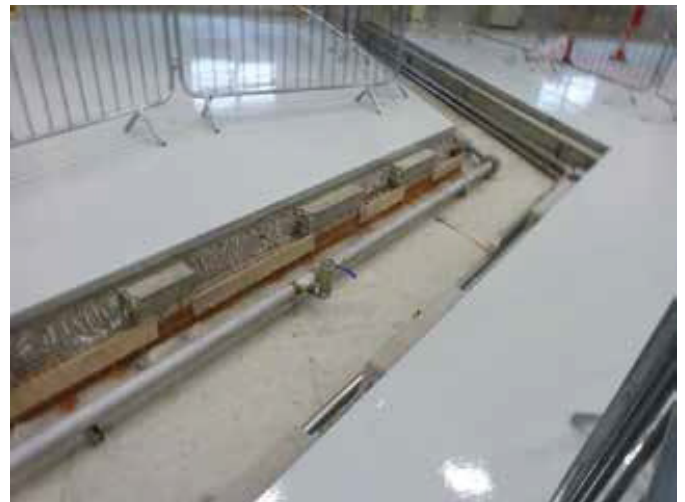
Complex corner trench design

The production areas need to have fully flexible workstations with constant movement of parts and equipment. As new wing assemblies are required the support stations move and therefore the services also move. The panels are lifted regularly to ensure production areas are working efficiently. For operators working within the facility, ease of access and safety are critical.