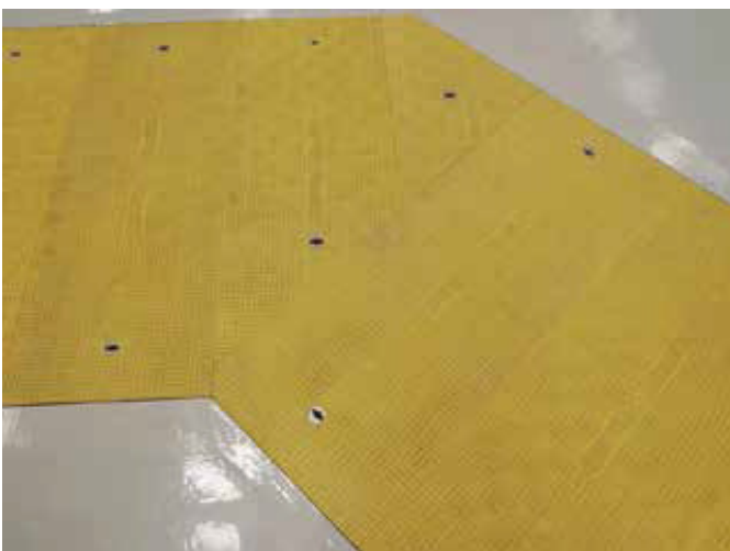
Bespoke trench covers for complex corner sections