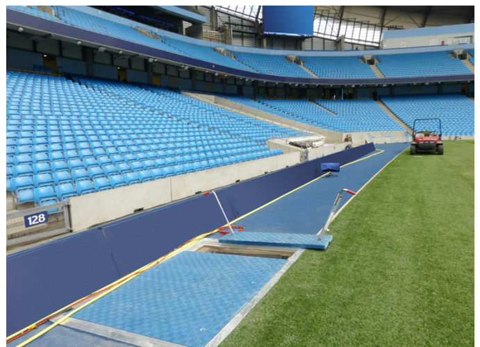
The Fibrelite trench covers and ergonomically designed lifting aid allows for a safe and easy removal