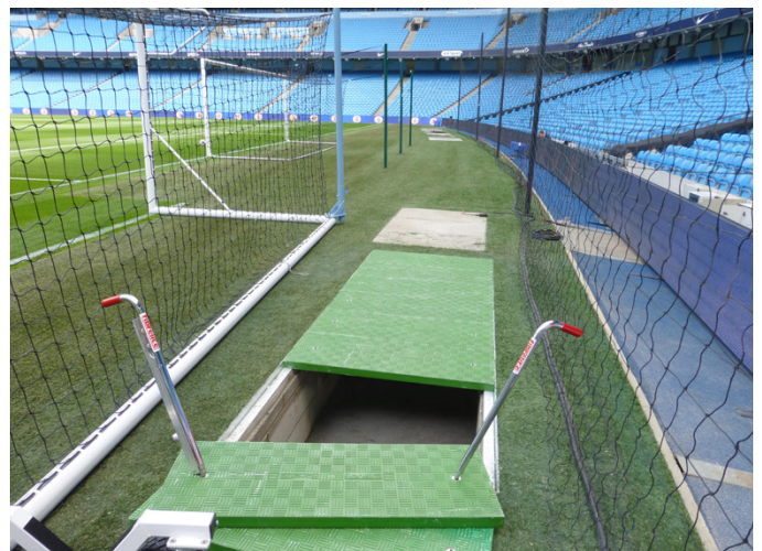
The recently installed Fibrelite coloured trench covers, suitable for many applications ranging from stadiums, water sewerage treatment plants, to airports and dock and ports