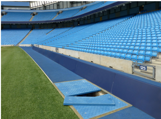
Fibrelite trench covers have an anti-slip surface