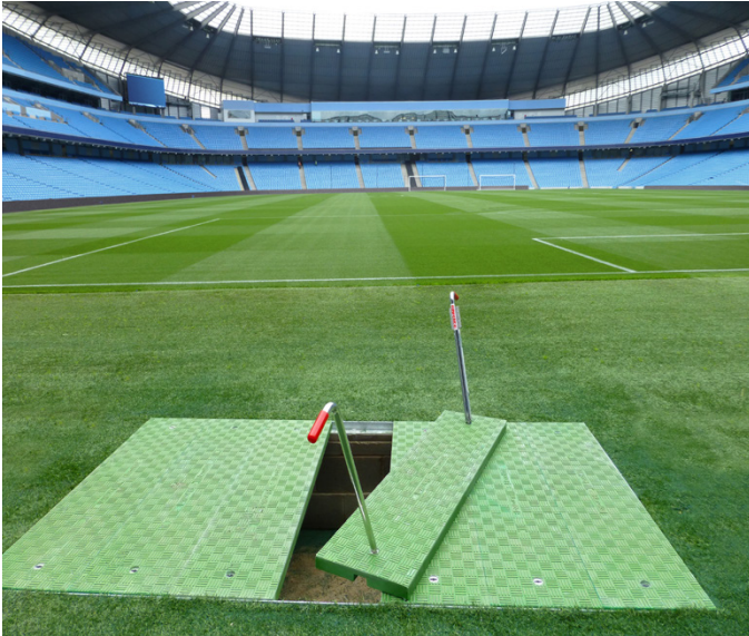
Large span: Fibrelite's trench covers go up to 1600mm in length at D400 (40 tonne) load rating

The composite trench covers were specified for the new and existing camera pits due to the manual handling issues experienced with the previously installed reinforced steel covers.