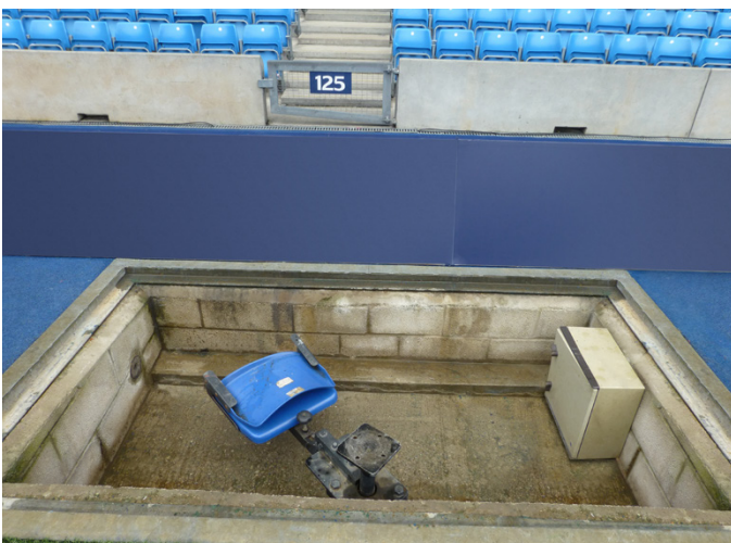
An existing camera pit to be covered by Fibrelite's composite trench covers