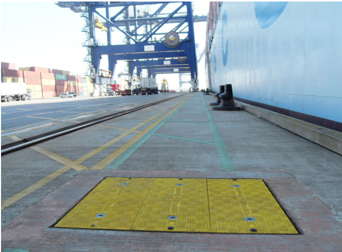
The Fibrelite 90 tonne load rated lightweight trench covers in position on the quayside