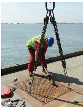
Costly and time consuming operation of removing the previously installed covers

The initial approach came from the port's maintenance team who were exploring alternative replacement options for the extremely heavy and corroding steel covers that required dedicated lifting equipment, which incurred substantial financial costs with equipment, manpower and time, every time fresh water was transferred to the ship.