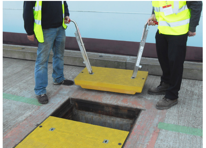
Simple and safe removal using the Fibrelite lifting handles

Fibrelite was tasked with providing a retrofit 90 tonne load rated lightweight cover that could withstand the rigours and working environment of an extremely busy commercial port.