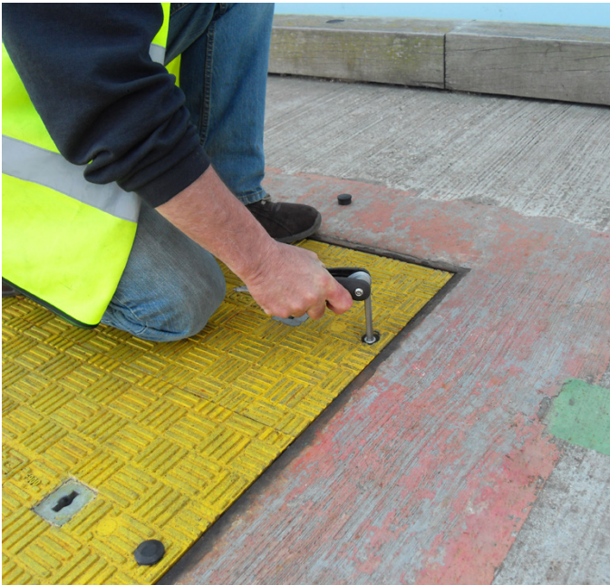
Operator removing the Fibrelite securing system