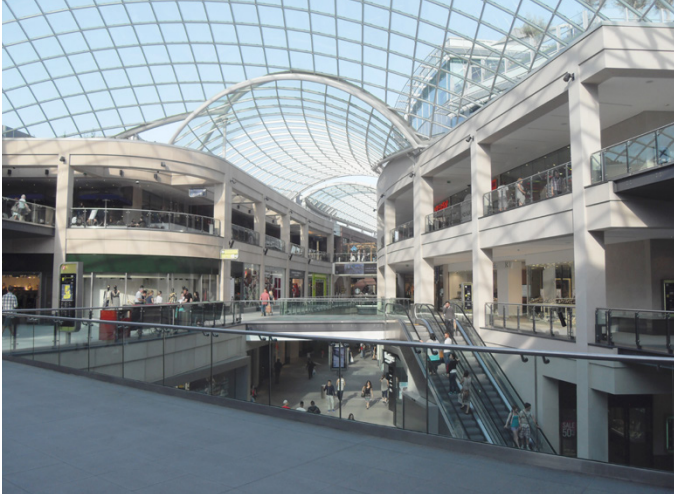
Major new shopping centre

190 Fibrelite trench covers are now installed in the state of the art Trinity Shopping Centre in Leeds. The consulting engineers specified Fibrelite for this project for ease of access to cable ducts that run all over the site. The panels are non-slip for a safe working environment in busy service areas in the centre.