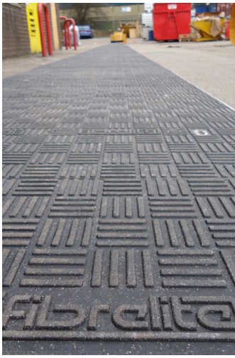
Ensuring a perfect fit, the panels are checked in the encapsulating frame before delivery