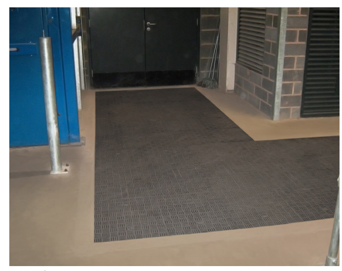
Fibrelite's trench panels can be used to cover large areas and corners

Fibrelite's trench panels have a standard width of 450mm, with lengths ranging from 800 to 1600mm. With lengths increasing in 50mm increments (800, 850, 900mm and so on) the customer found that all requirements for different load ratings and sizes could be catered for by Fibrelite. For this project B125, C250 and D400 panels were all used in lengths of 800, 1000, 1400 and 1600mm.