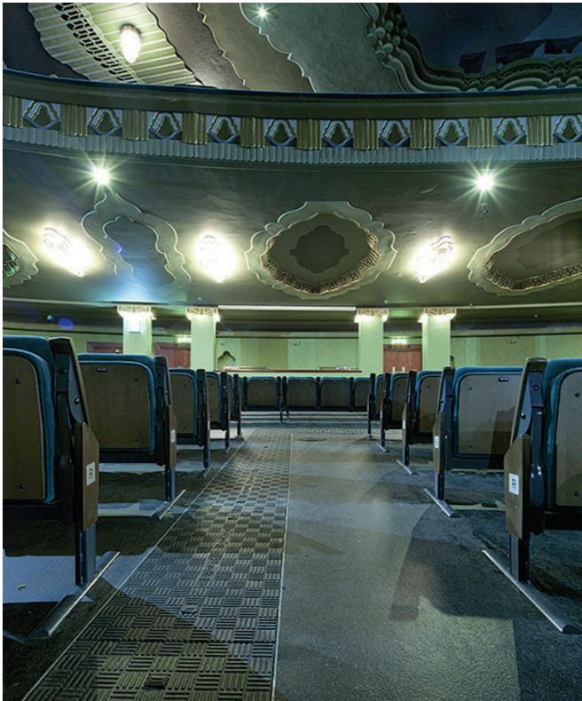
Lightweight Fibrelite covers

The architects (Foster Wilson Architects LLP) who were project managing the refurbishment of the theatre tasked with providing a discreet and practical method of housing multicore cables that ran from the stage to the control desk during music concerts. Previously the cables had been run above ground subsequently causing damage to the beautiful interior of the theatre.