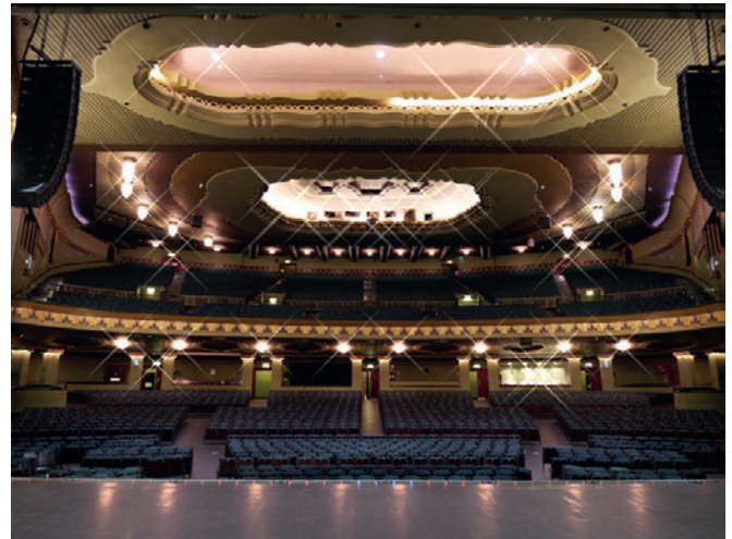
Easy single person lifting system

Fibrelite supplied a bespoke encapsulating frame for both multicore cable routes along with a 1.5 tonne load rated trench cover to cover the cable trenches. The design was extremely challenging as not only did the cable trenches change in direction but they also changed in elevation. The Fibrelite cover incorporates an anti-slip material within the top treaded surface of the covers which provides unparalleled anti-slip/skid properties for a composite cover.