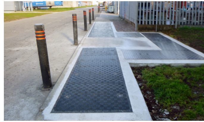
No specialist equipment is required to remove and replace Fibrelite covers – easy two person manual removal