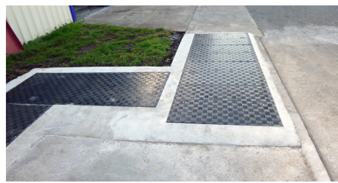
Bespoke Fibrelite GRP composite trench covers

Fibrelite delivered the bespoke solution just over 1 month after receiving the order. The customer expressed an interest in updating further UK facilities with Fibrelite trench covers.