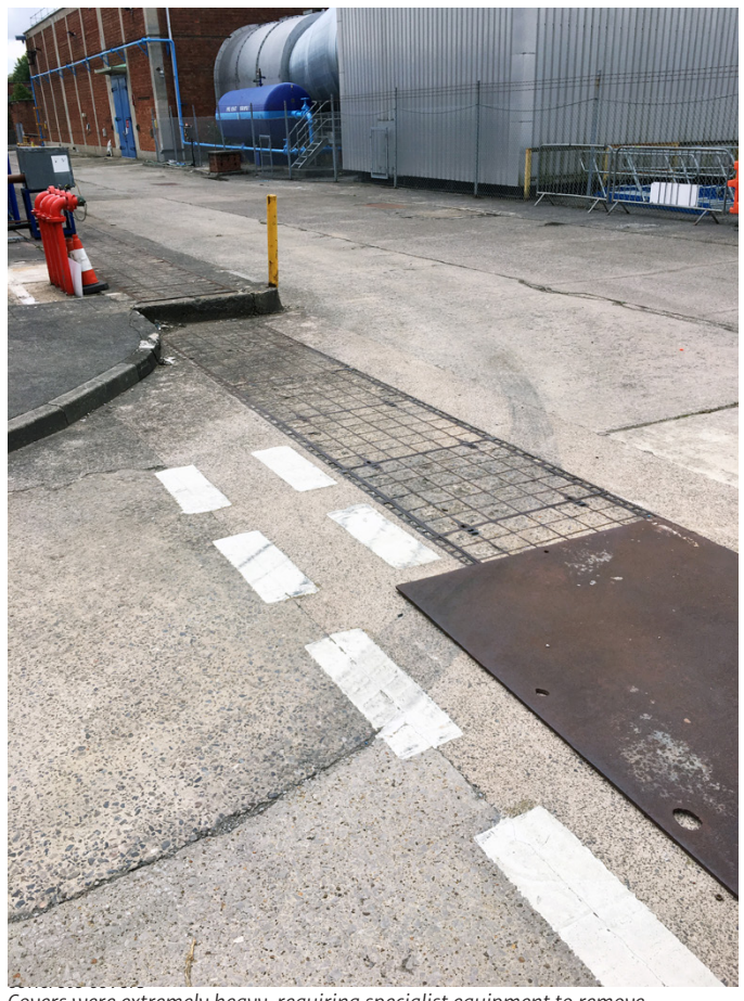
Covers were extremely heavy, requiring specialist equipment to remove