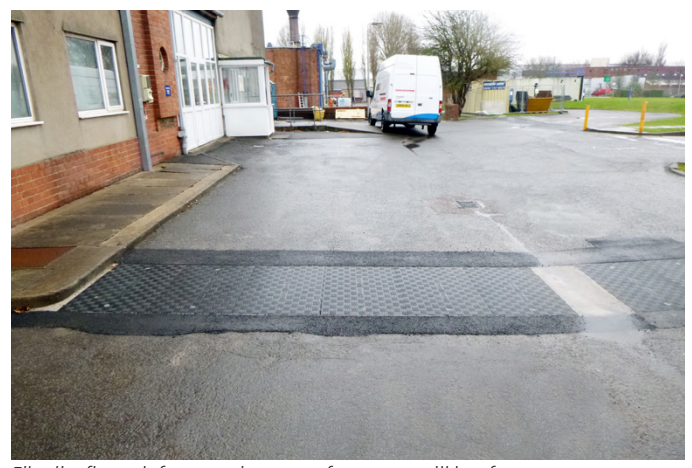
Fibrelite fit-and-forget maintenance free covers will last for years to come