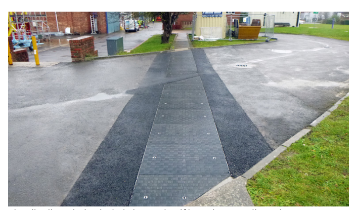
The Fibrelite solution included a number if bespoke cover dimensions