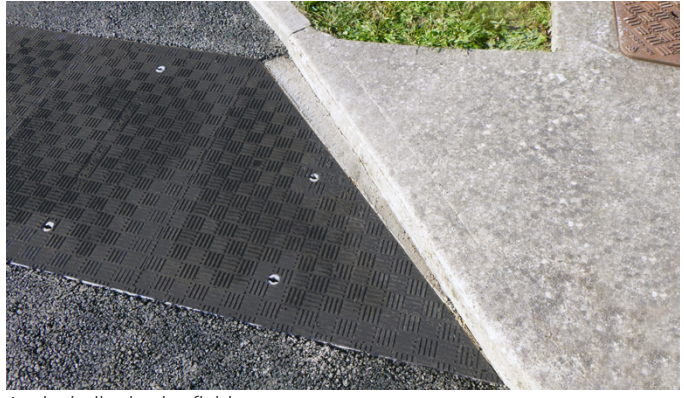
Aesthetically pleasing finish