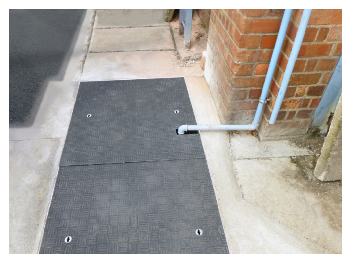
Fibrelite covers provide a lightweight alternative to concrete, alleviating health and safety risks