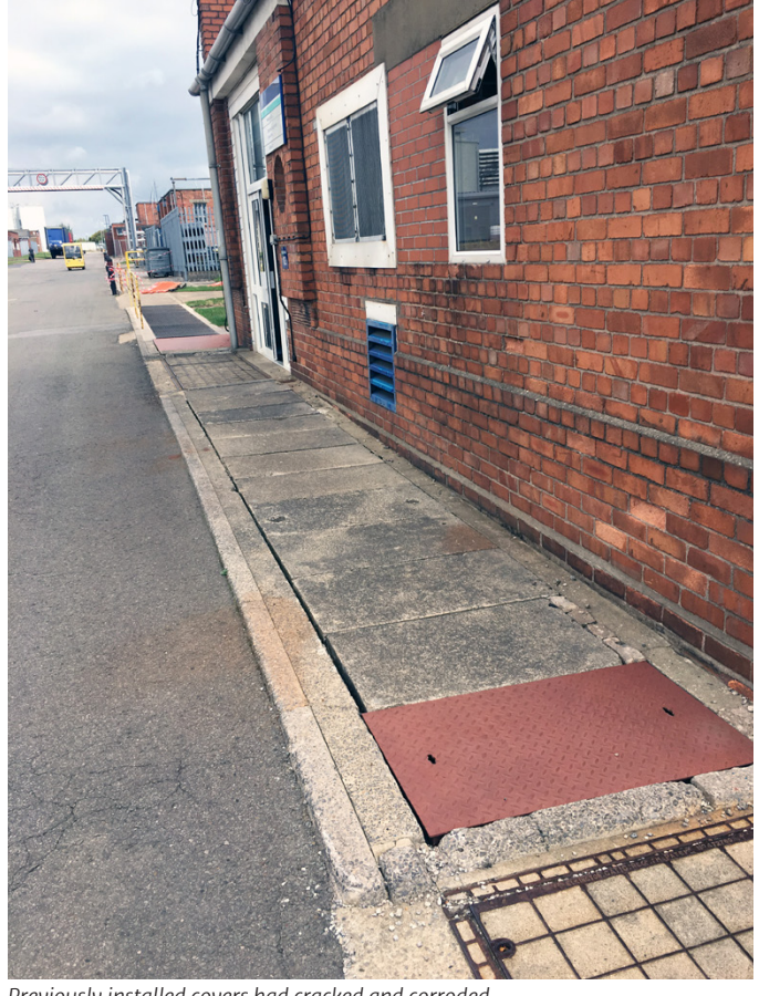
Previously installed covers had cracked and corroded