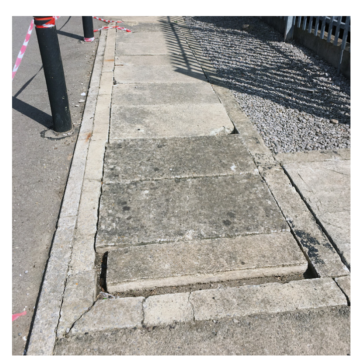
Previously installed failing concrete trench access covers