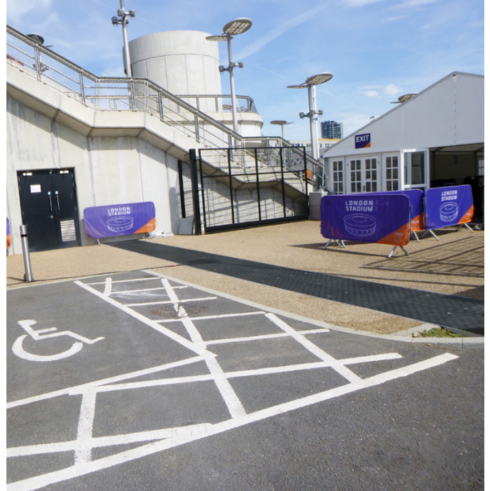
Previous trip hazard eliminated by Fibrelite covers that fit perfectly in the trench

The customer has now achieved an aesthetically pleasing finish as well as getting the technical benefits of Fibrelite's GRP trench access covers.