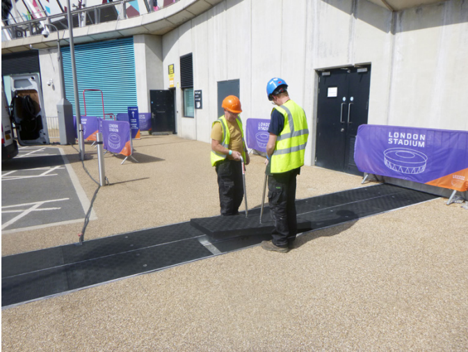
Fibrelite covers can be easily removed by two people