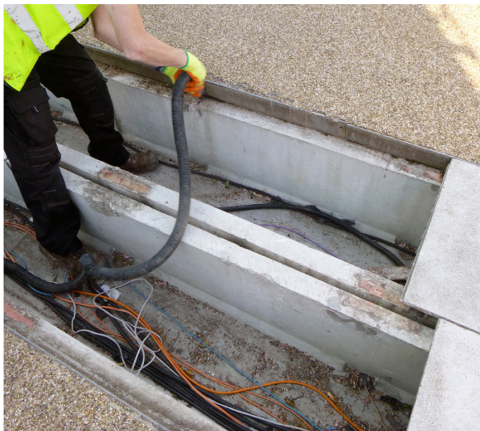
The trench must be accessed every time the stadium hosts an event

This London stadium approached Fibrelite to replace their damaged trench covers with a retrofit solution. The London stadium primarily hosts football matches; however it is a multi-event stadium also hosting music concerts, American football (NFL) and athletics. The client needed a lightweight and durable solution to replace the damaged trench covers. A solution that incurred minimal upheaval to the functionality of the site was also required, so cover dimensions needed to be customised to suit the existing trenches.