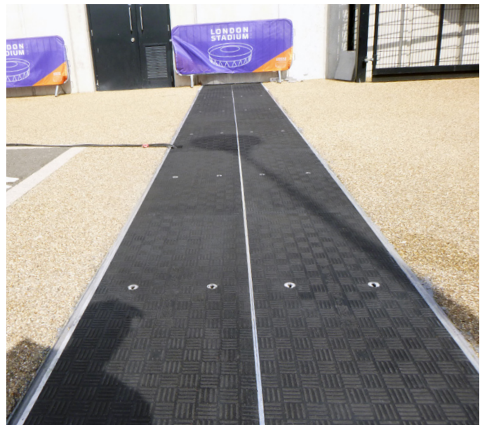
Fibrelite's GRP trench access covers were installed and fully operational within 2 days