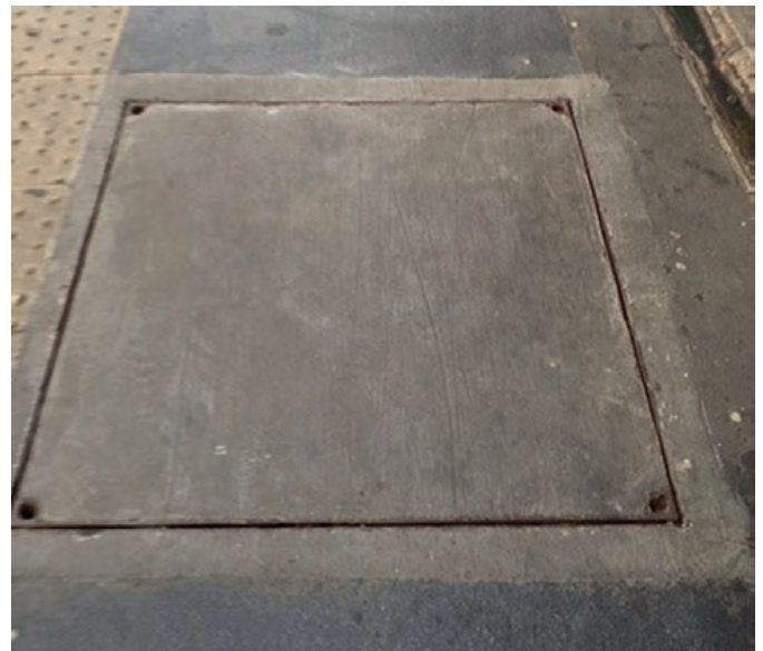
Previously installed, heavy, difficult to lift concrete covers

The covers on the platform provide essential access to services housed below the platform level and are lifted regularly, so routine maintenance work can be carried out. The previously installed covers were heavy, concrete infilled covers which proved very difficult to remove and presented serious manual handling issues to operatives. Removing the covers was a costly and time consuming process, with specialist lifting equipment often required.