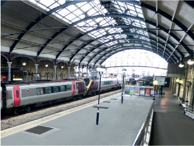
Fibrelite covers feature an anti-slip surface

Fibrelite has recently developed a range of bespoke, lightweight, composite trench covers, dramatically reducing the cost to cover larger openings. These bespoke covers have recently been installed over access hatches in the platform of a major UK rail station to give quick and easy access to services below platform level.