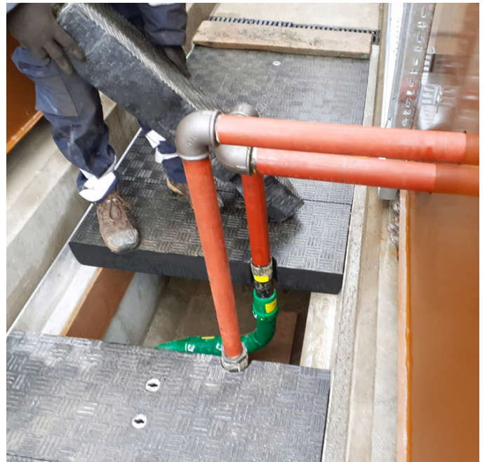
Apertures were required in some covers to accommodate pipework connecting from within the trench to above ground networks