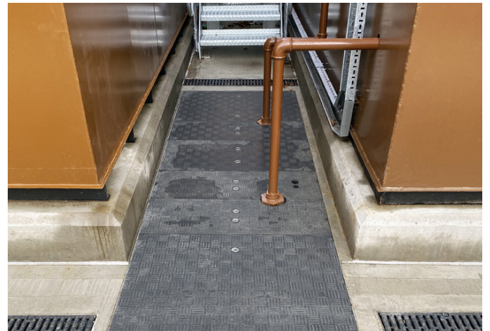
All trench covers can be safely removed manually by two people while strong enough to withstand sustained loading