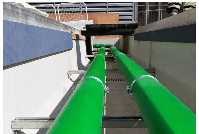
KPS' plastic piping provide a safe, easy-install fluid transfer solution