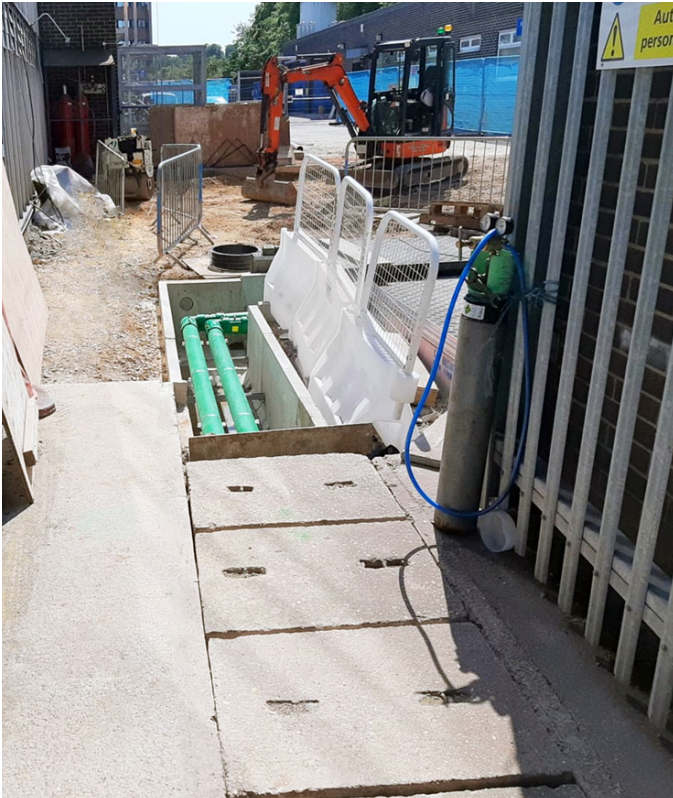
Previously existing concrete access covers were heavy and difficult to remove and replace