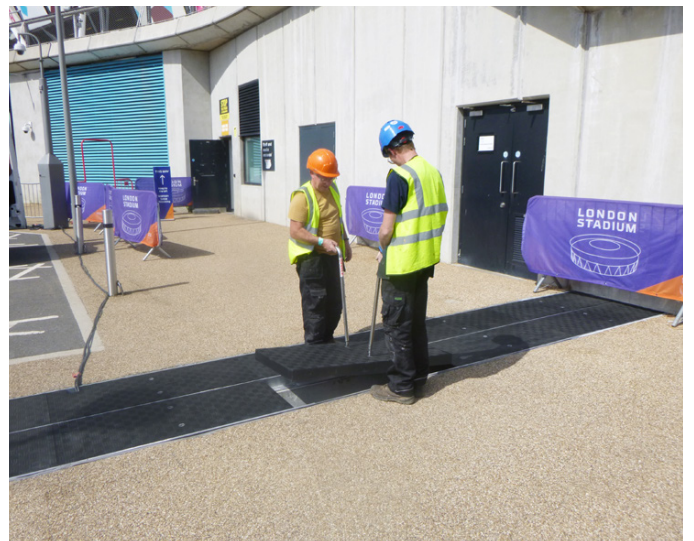
Fibrelite composite trench covers can be manually removed by two people using Fibrelite's FL7 lifting handles (as seen in the above image on another site)