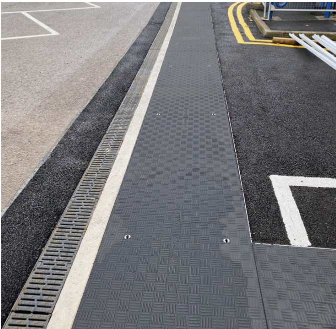
Fibrelite covers are corrosion-resistant, unaffected by water, underground gasses and most chemicals