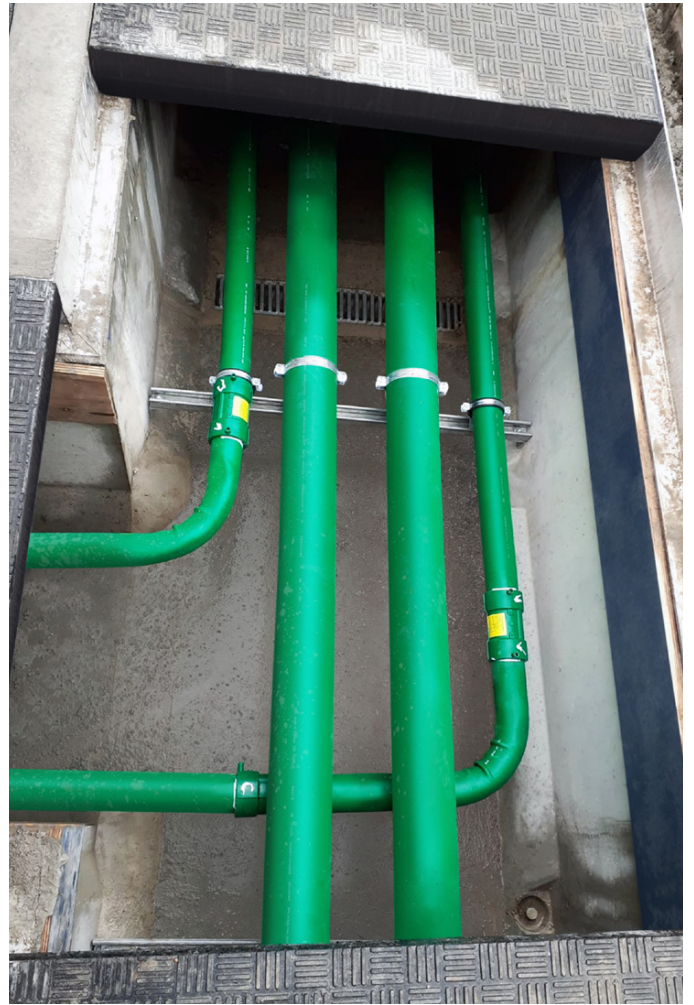
Quick access to piping is vital for maintenance and inspection

Hilton Bodill Construction contacted Fibrelite on behalf of their client, Nottingham City Hospital, who required a lightweight and strong modular covering system for their newly re-routed service trench, which replaced the traditional heavy concrete slabs. These protect and provide access to the hospital's backup diesel generators supply pipes (diesel and oxygen). An easy-install, corrosion-free replacement for their previously existing steel piping was also required.