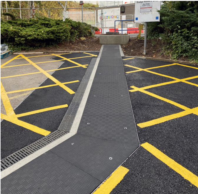
Hilton Bodill Construction specified Fibrelite covers and KPS piping for Nottingham City Hospital refurbishment