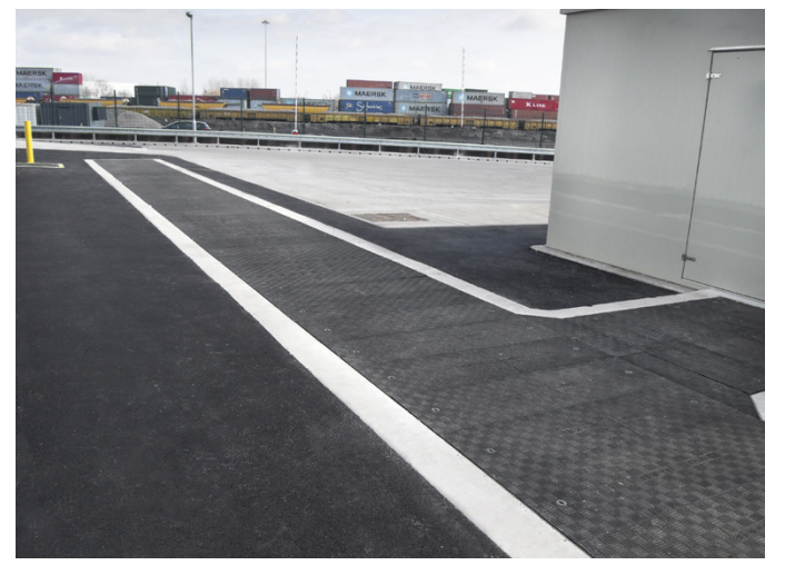
Fibrelite covers will not corrode over time, unlike metal and concrete