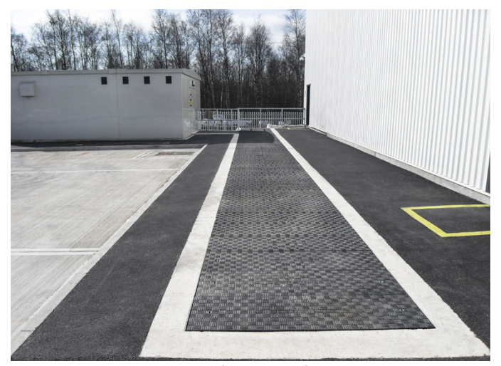
Fibrelite trench covers provide a safe walking surface even when wet

The trench covers also provide a safe walking surface even when wet which has been tested to be equivalent to a modern, high-grade road surface. Manufactured using a specialised composite material, they will not corrode over time, unlike metal and concrete, meaning that they will not need to be replaced for many years.