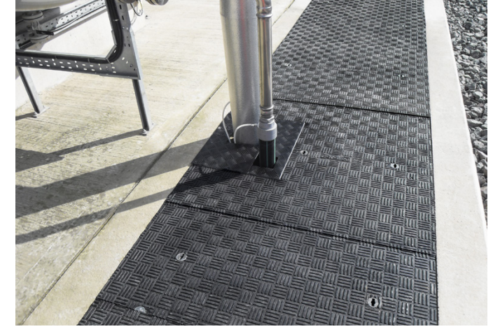
Fibrelite provided a tailormade long-term solution

This Doncaster maintenance facility now has a long-term access solution that eliminates manual handling problems while improving the overall efficiency and effectiveness of the site.