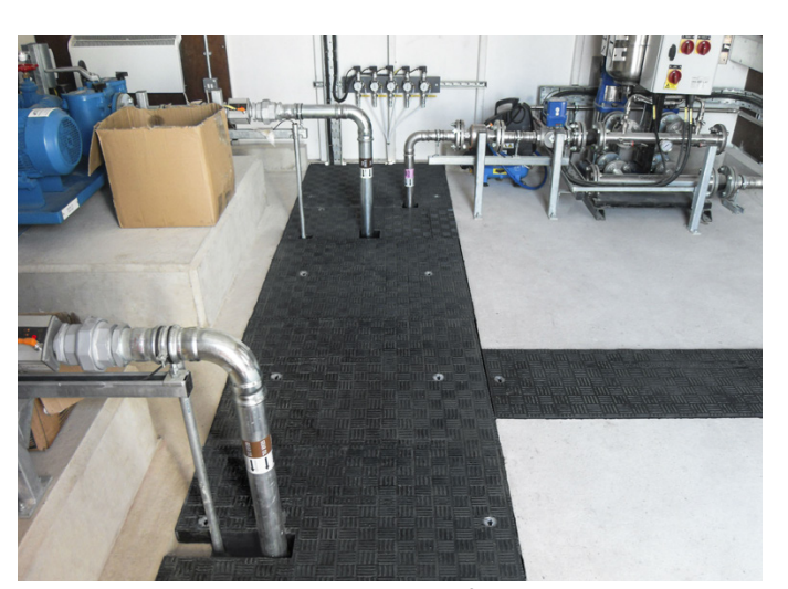
Fibrelite covers can accommodate service pipes of all shapes and sizes