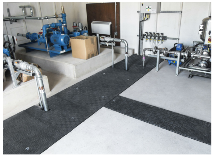
Two different load rated covers were used for the installations, B125 and D400