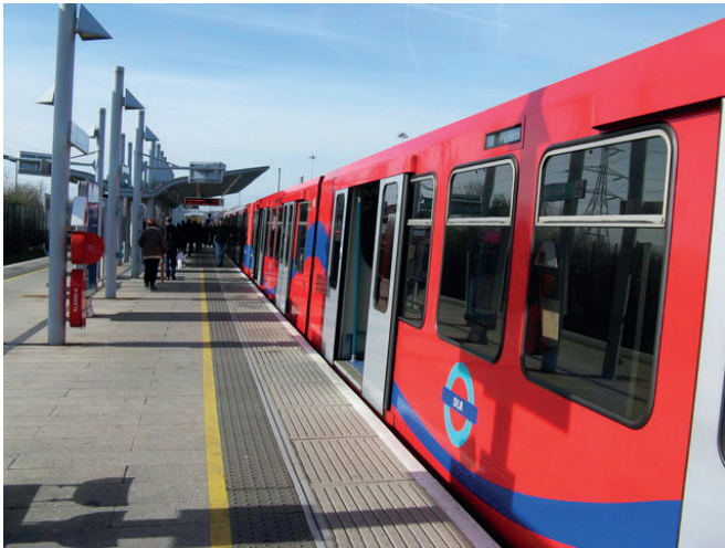
Railway Maintenance Depots

Fibrelite Supply Lightweight Cable Trench Covers to One of UK's Largest Railway Maintenance Depots