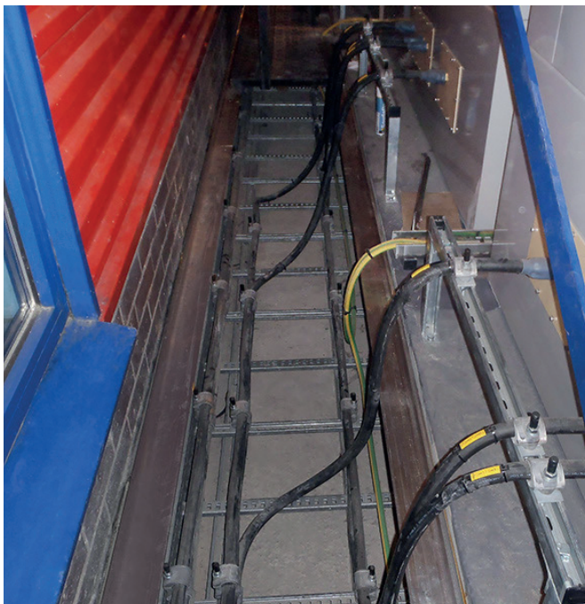
High and low voltage cables leaving trench to switchboard at regular intervals

Fibrelite had two major issues to deal with when installing and manufacturing the retrofit solution. Firstly, the concrete rebate was dimensionally inconsistent throughout, causing an undulating surface. Secondly, high and low voltage cables running through the trench also had to come out of the trench to the switch boards in various positions along the trench.