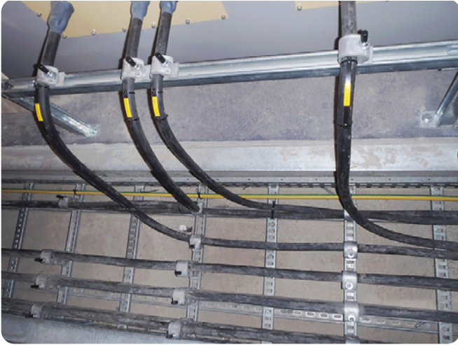
Expansive trench requiring coverage