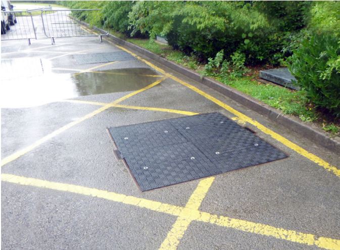
Fibrelite provided a selection of lightweight covers