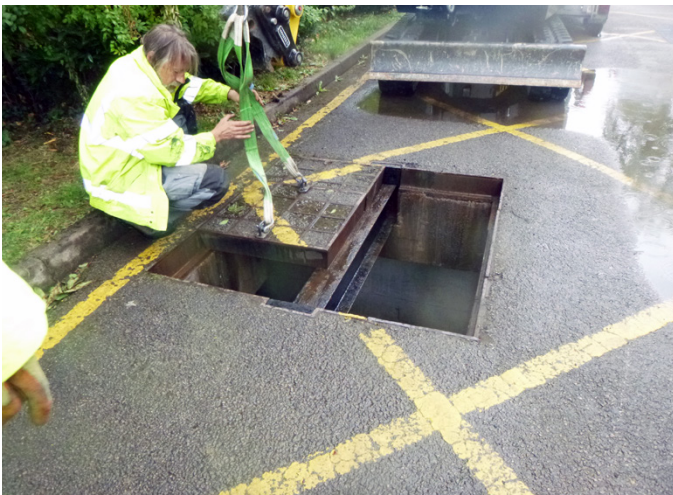
Due to the weight and difficulty in removing the covers critical time is lost in emergency situations