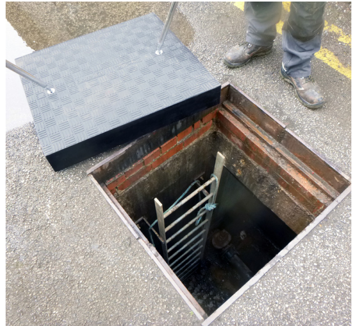
The covers provided access to underground water valves