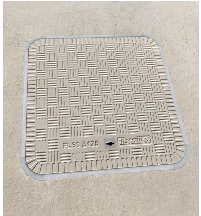
Bespoke coloured cover to match floor