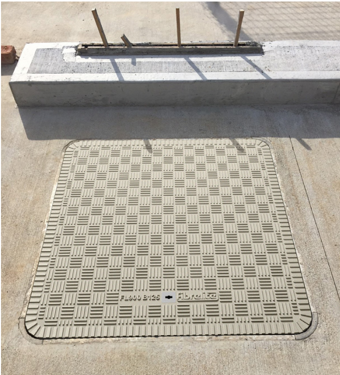
Watertight FL900 B125 cover