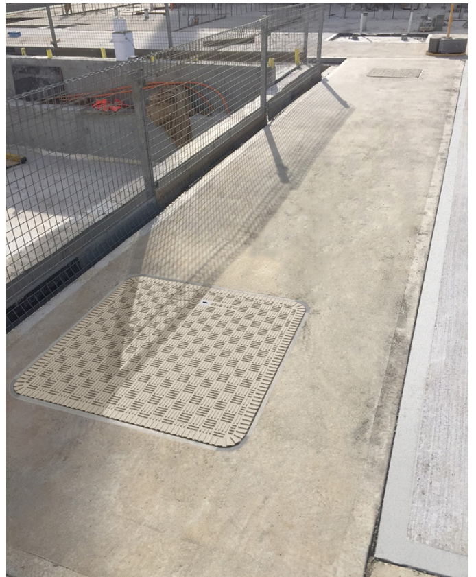
Installed cover over balance tanks

Fibrelite's standalone covers proved the perfect solution. Composite covers are chemically inert, so have no reaction to either water or chlorine, meaning that the covers will remain watertight and safe to walk on year on year. They are also lightweight, so can be safely and quickly removed by one person using the ergonomically designed FL7A lifting handle. Fibrelite provided a custom coloured solution to blend in with the surroundings. The patented monolithic structure of the covers means that they will not crack or delaminate or fade, as tested by BSI.