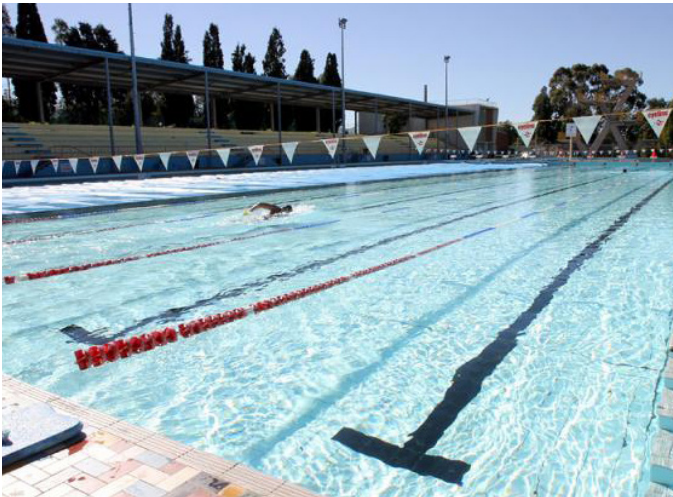
Leisure centre redevelopment Auburn, Sydney