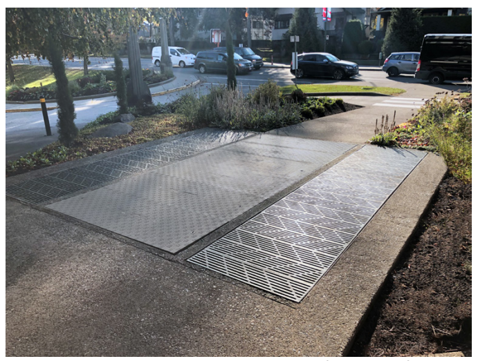
All Fibrelite covers are skid/slip resistant, providing a safe walking surface when wet or dry

Fibrelite covers also have an anti-slip/skid tread pattern equivalent to a high-grade road surface so provide a safe walking surface, which is especially important as these covers are in an area with regular foot traffic.