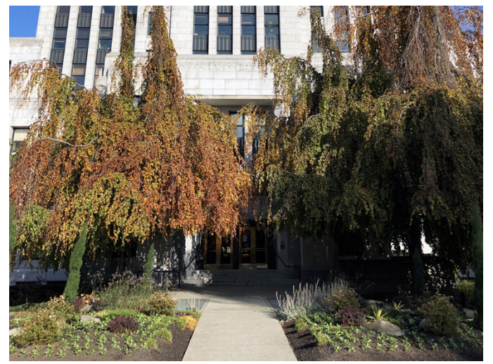
Fibrelite provided lightweight retrofit trench access covers to Vancouver City Hall