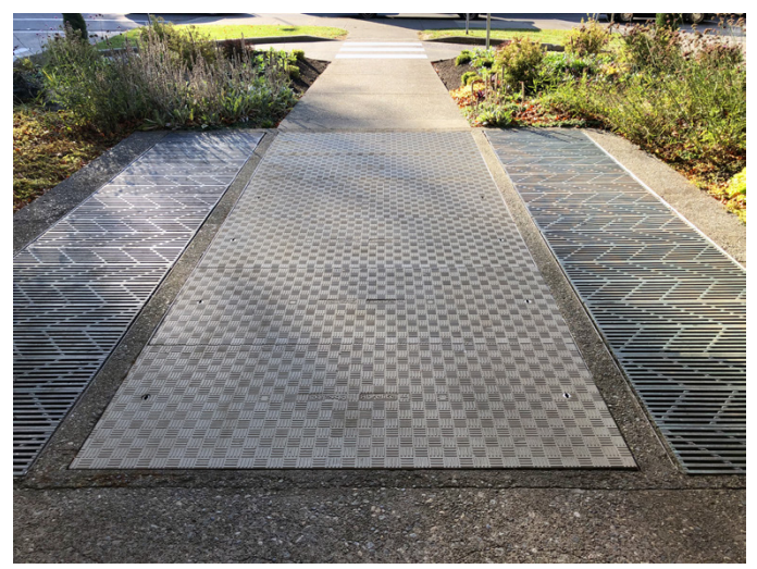
Fibrelite covers allow quick safe manual removal

Vancouver City Hall required a safe replacement for previously installed concrete trench access covers located on a walkway outside of the hall, over a generator. They reached out to Fibrelite via Keller Equipment (Fibrelite distributor) for a solution.